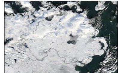
Satellite image of Northern Ireland on 22 December 2010

FACT - This year, the UK Government has decided to cut the winter fuel payment by £50 for people aged between 60 and 80, and by £100 for people aged over 80